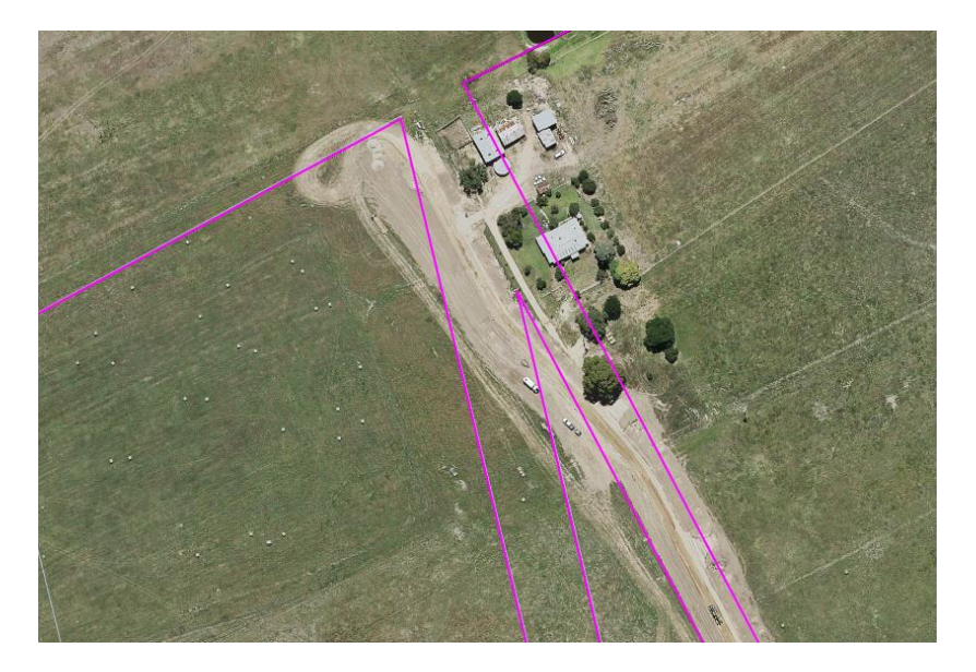
This report details the required statutory process to formalise the road deviation under the required legislation.