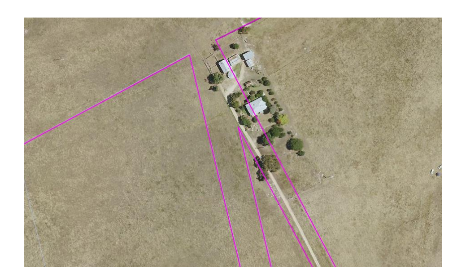
The aerial photograph below taken in 2022 shows the constructed road was deviated away from the dwelling.