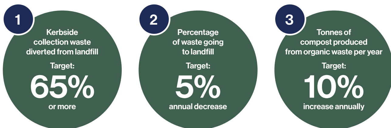
Table 1 Council Plan Priorities

RCoW Council Plan 2021- 2025 sets strategic indicators for waste and resource recovery.